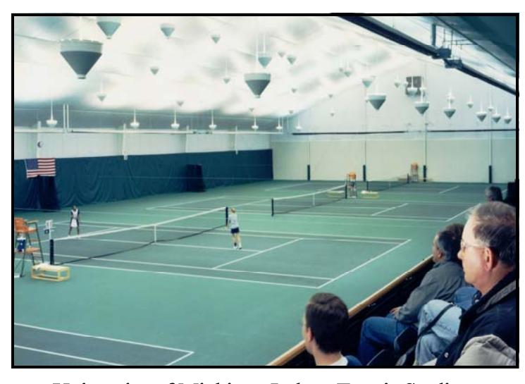
University of Michigan Indoor Tennis Stadium 1997 Court of the Year

Chagrin Valley Indoor Tennis 9 - Courts 4" R-16 Fiberglass ROD Suspension System